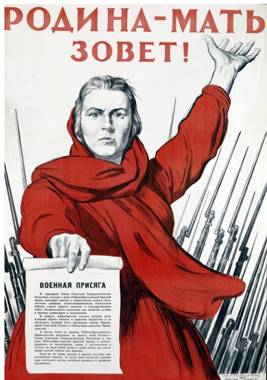
Figure 3. Epatko, L. (2017). These Soviet propaganda posters once evoked heroism, pride and anxiety. PBS.

When Hitler attacked, thousands volunteered to fight, not to serve Stalin, but to protect “Mother Russia”, and with that their families (Anderson, 2015). The continuation of the war era meant a call for volunteers. This particular poster by Irakly Toidze from 1941 shows “Mother Russia” holding out the Red Army Oath of Allegiance, and above her are the words: “The Motherland Is Calling” (Epatko, 2017). Additional evidence of patriotism is the fact the Eastern Front was known as the Great Patriotic War.