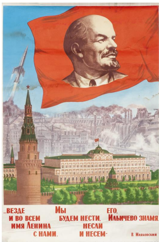
Figure 4. Artist Unknown. (1959). Soviet Vintage Posters. International Poster Gallery.

When Hitler attacked, thousands volunteered to fight, not to serve Stalin, but to protect “Mother Russia”, and with that their families (Anderson, 2015). The continuation of the war era meant a call for volunteers. This particular poster by Irakly Toidze from 1941 shows “Mother Russia” holding out the Red Army Oath of Allegiance, and above her are the words: “The Motherland Is Calling” (Epatko, 2017). Additional evidence of patriotism is the fact the Eastern Front was known as the Great Patriotic War.