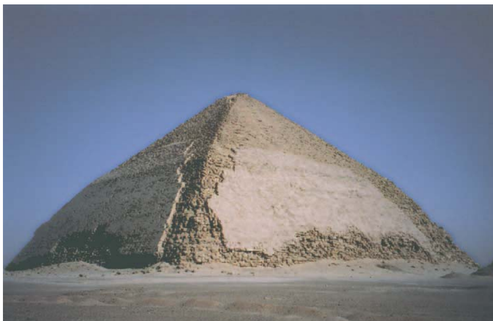
Fig. 4 Dahshur, Bent pyramid of Sneferu