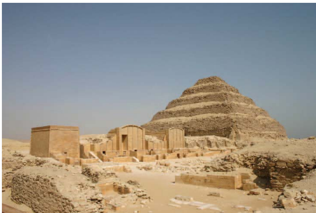
Fig. 2 Complex of Step pyramid of Djoser

1948; Lehner 1997, 84) it was build in six stages ( M_1 - M_2 - M_3 - P_1 - P_1' - P_2 ) from initial rectangular mastaba with central shaft to the six-step pyramid with many shafts, galleries and chambers. They were two access corridors leading to central mastaba structure which was build like underground palace with private apartments, magazines, corridors and galleries. Decorations were organized in six panels. Three on the north side were topped by an arch and djed pillars and the Horus name Netjerikhet was also framed in the limestone. Southern panels are framed as false door and the king is shown during a rituals ( Edwards 1991, 36-40; Lehner 1997, 88). The burial chamber was made as granite vault right beneath the central shaft ( Lehner 1997, 88). The complex contained the area of 15 ha was surrounded by large enclosure wall which was 10.5 m high and 1645 m long. Northern temple, north and south pavilions, court of the serdab, Heb-Sed court, Temple T, southern altar, large court, south tomb with the chapel and west massifs were placed inside this enclosure ( Lehner 1997, 84-85).