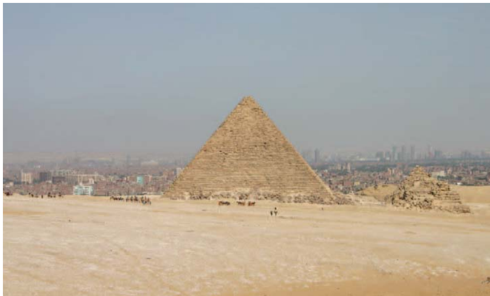
Fig. 7 Giza, Menkaure pyramid