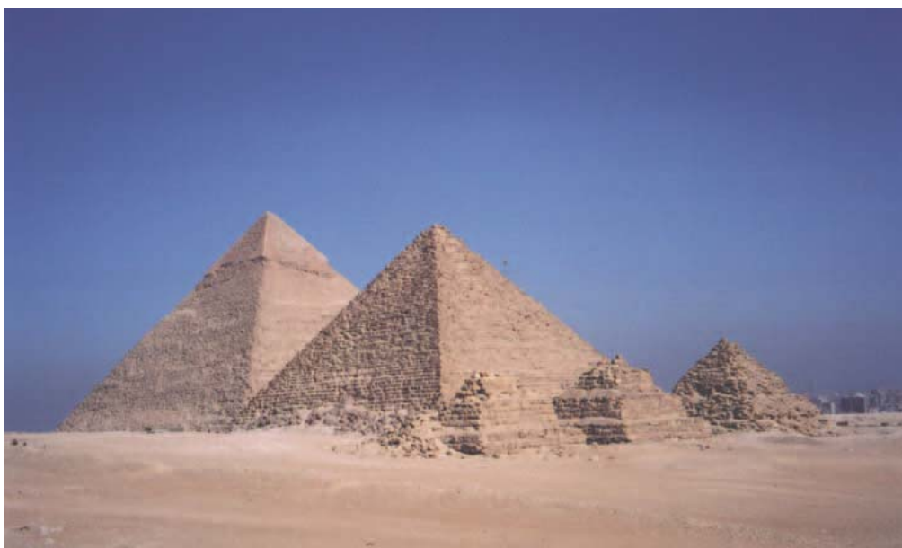
Fig. 6 Giza, Khufu pyramid on the left and Khafra pyramid on the right side

with smaller proportions. The pyramids at Giza were surrounded by pyramid complex which includes the mortuary temple, causeway, the valley temple and in some cases the queens' pyramids were near the main pyramids ( Edwards 1991, 98-151; Lehner 1997, 106-137). On the north east side of the Khafra pyramid the Great Sphinx was also built along with the Sphinx temple.