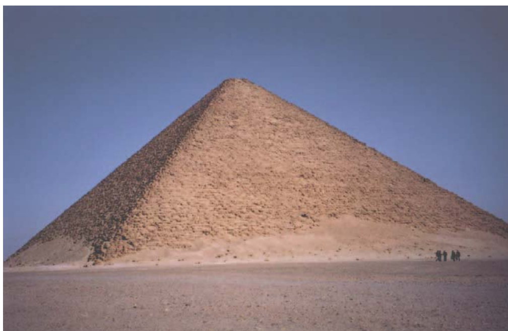
Fig. 5 Dahshur, North or Red pyramid of Sneferu

His son and sucesor Khufu (c. 2589-2566 BC) move the royal necropolis to Giza where he build the biggest ancient Egyptian pyramid. His sucesors Khafra (c. 2558-2532 BC) and Menkaura (c. 2532-2503) also build pyramids at Giza plateau