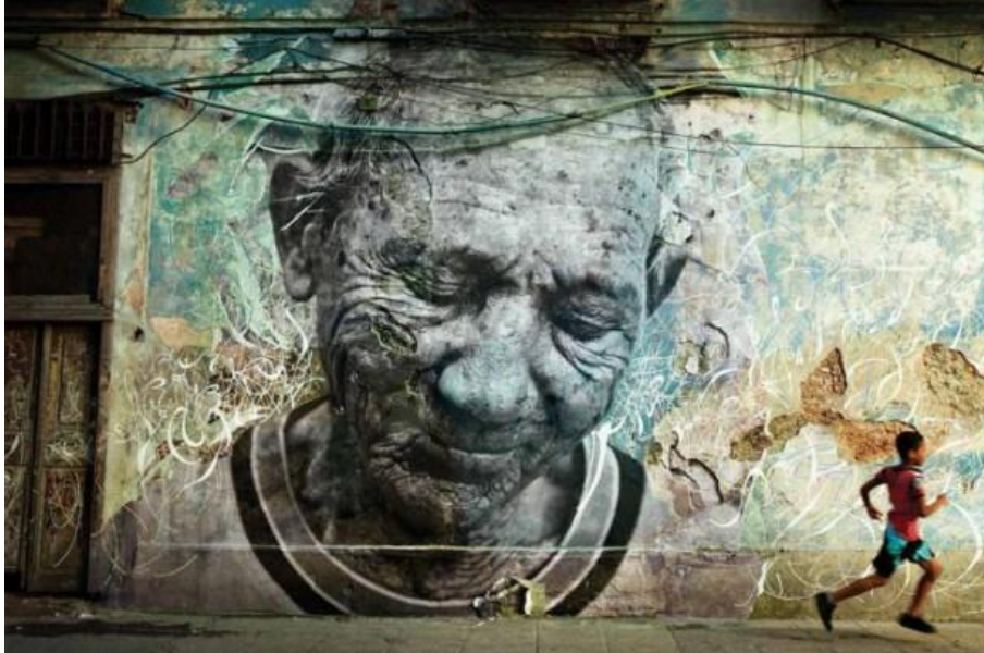
Figure 4. A photo of Parlá's project with JR "Wrinkles of the city".

large images in public places. Parlá's most notable work "Wrinkles of the city: Havana" was made in collaboration with the French artist JR.