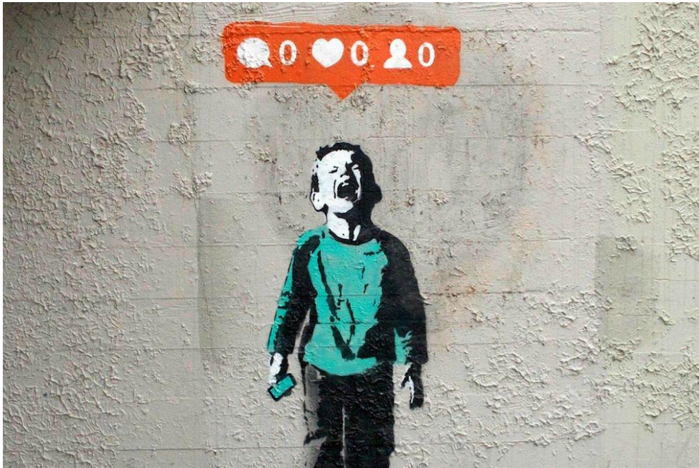
Figure 16. A photo of Banksy's work criticizing social networks.