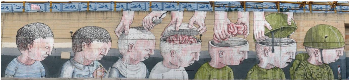
Figure 9. A photo of Blu's work showing brainless soldiers.

Brazilian artist Eduardo Kobra stands out the most owing to his distinctive usage of colors and patterns. The subject of his work are mostly notable people from history, painted as large murals in multiple colors. Kobra's significant technique is repeating squares and triangles throughout the whole surface of his murals and filling it with differently shaded lines. Thus, his work is widely appreciated and often awakes nostalgic feelings due to its subject (Figuerola, 2018).