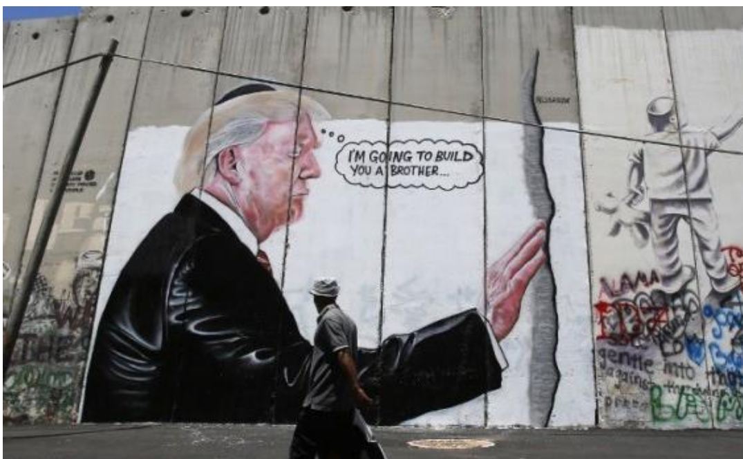
Figure 18. A photo of mural on Israel's West Bank.

To sum up, street art on the internet may not have the best quality and the greatest impact, but the biggest advantage of online street art is undoubtedly its reach. The possibility to share art works from the street has brought the whole street art culture closer to the audience and has made anonymous voices to be heard. One of the examples is the mural believed to be made by the Australian graffiti artist Lushsux which was painted on Israel's West Bank wall. The mural was made after the president of the USA, Donald Trump, has made a visit to Jerusalem (The New Daily).