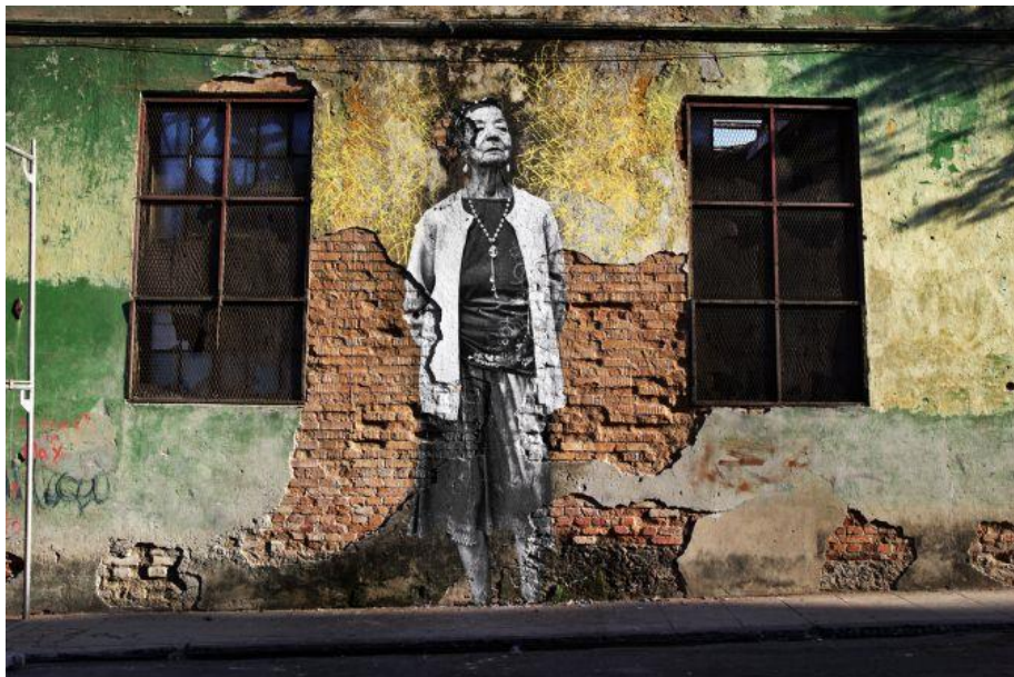
Figure 5. "Wrinkles of the city". Taken from: Jose Parlá (2012).