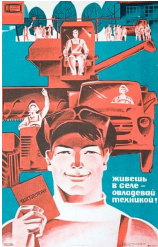
Figure 1. Hecimovic, A. (2014). Seven decades of Soviet propaganda – in pictures. The Guardian .

This poster celebrates mechanisation in agriculture, and it shows both men and women working in the sector. It was used as a signifier of the importance of work, stating: “You live in the village, master the technology”.