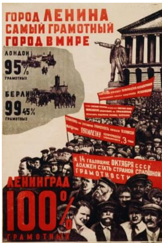
Figure 1. Hecimovic, A. (2014). Seven decades of Soviet propaganda – in pictures. The Guardian .

Education and raising the literacy was an important goal in the U.S.S.R., and this poster from 1932 praises Leningrad as being 100% literate (Hecimovic, 2014).