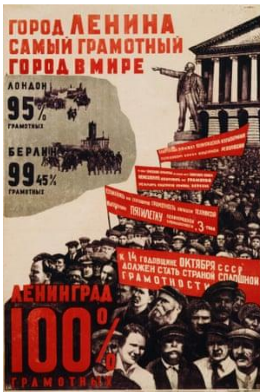
Figure 2. Hecimovic, A. (2014). Seven decades of Soviet propaganda – in pictures. The Guardian .

This poster celebrates mechanisation in agriculture, and it shows both men and women working in the sector. It was used as a signifier of the importance of work, stating: “You live in the village, master the technology”.